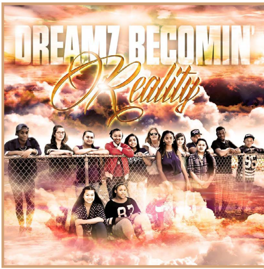
Kids who participated in the Dreamz Becomin' Reality project got to record their works on an album that will be released later this year!